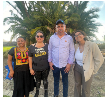
CCE with UFW ( United Farm Workers) recipients of the award organizer of the year by the San Diego Labor Council