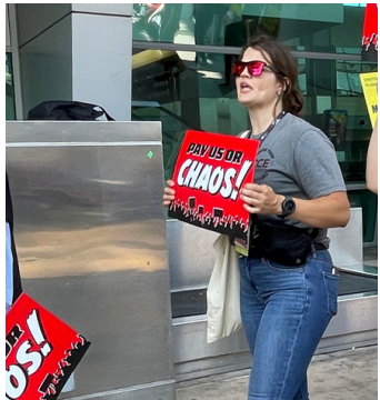
CCE in solidarity with flight attendants for a fair contract.