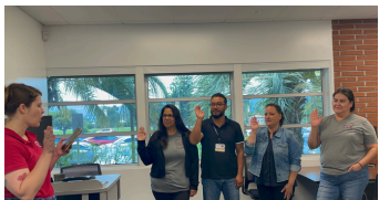
CCE Exec. swearing in our 2024-2025 site representatives