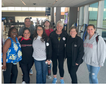
CCE with Randi Weingarten, in attendance for Classified day of Action.